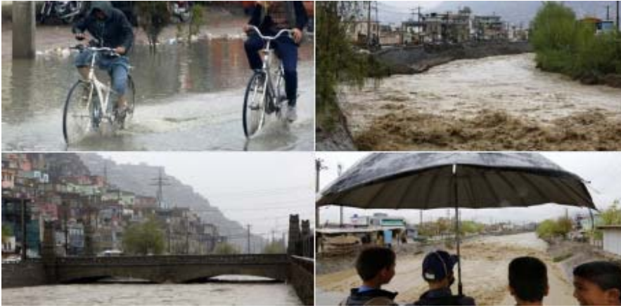
Rivers roaring in the city of Kabul, Afghanistan April 16, 2019